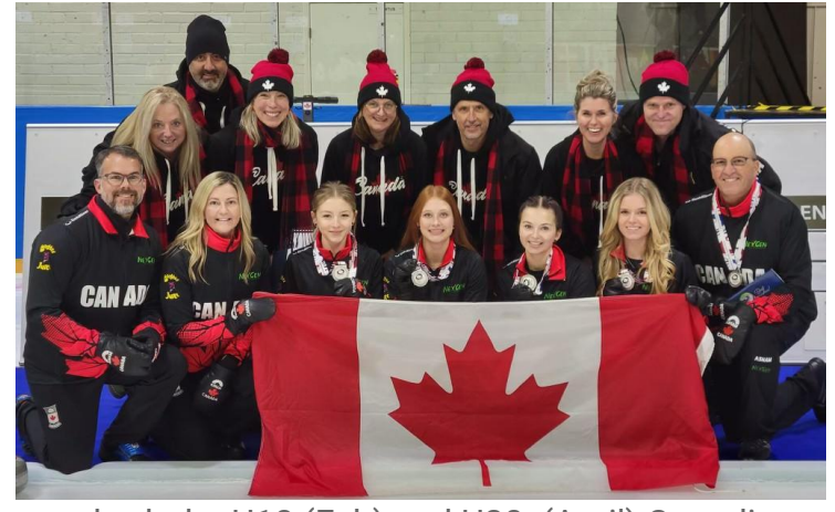
Team Plett had an amazing 2023! They won both the U18 (Feb) and U20 (April) Canadian Championships (the first team to ever win both events). They also won silver at the Canada WInter Games (Feb). The win at U20's earned them a trip to the World Junior B Championships (Dec) where they won a silver medal and qualified for the 2024 Junior A Worlds in February 2024.