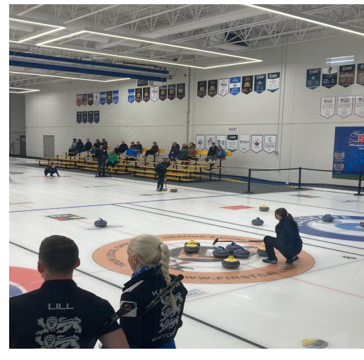
Spectators on ice for the MDSS(Oct)