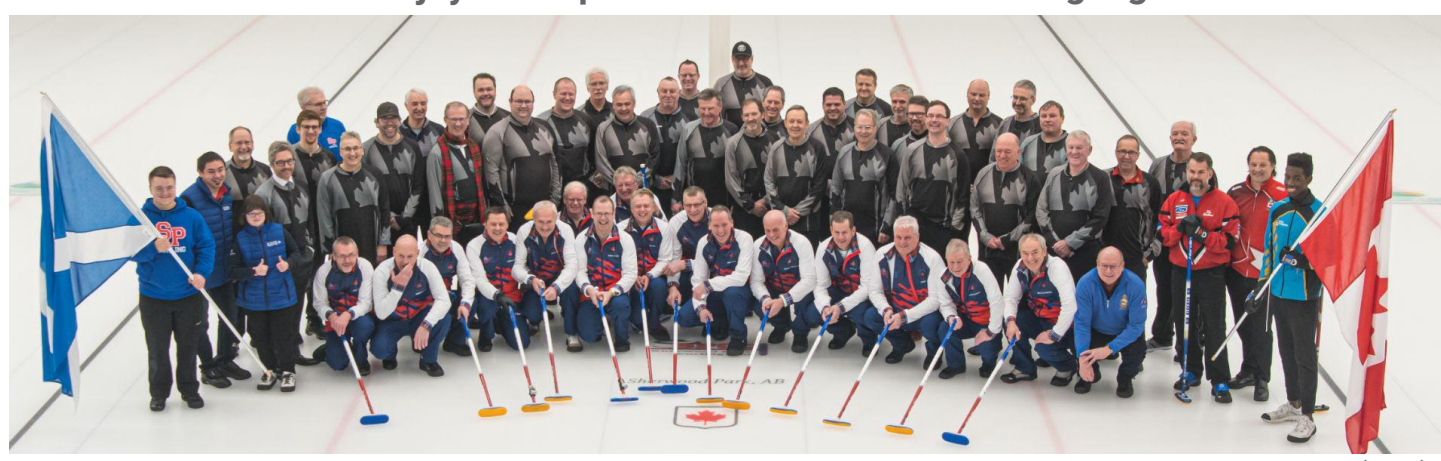
Strathcona Cup (Jan)