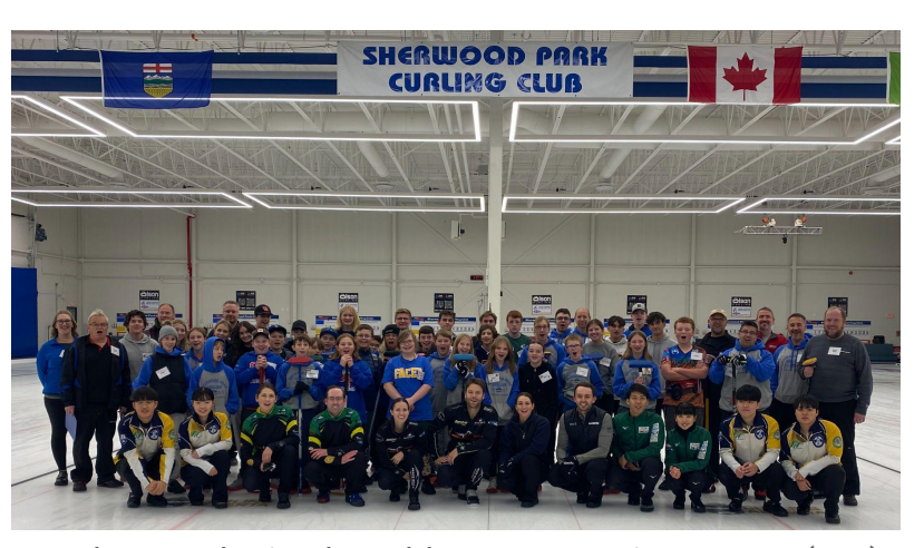
Wed Jrs and Mixed Doubles Super Series Teams (Oct)