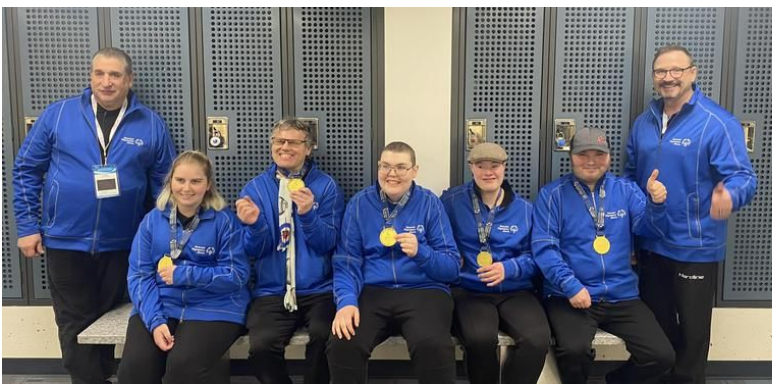
Special Olympics AB WInter Games (Feb)