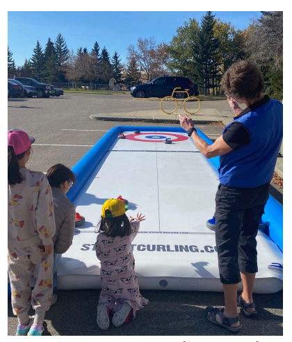
Street curling at the Open House (Sep)