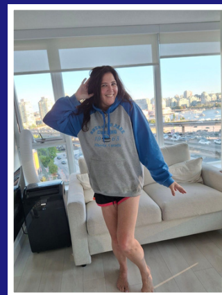
Tuesday Morning Lady Looking Great!